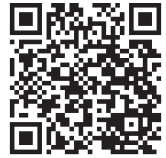
Scan QR code for product video.