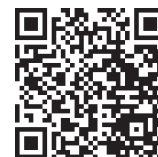
Scan QR code for product video.